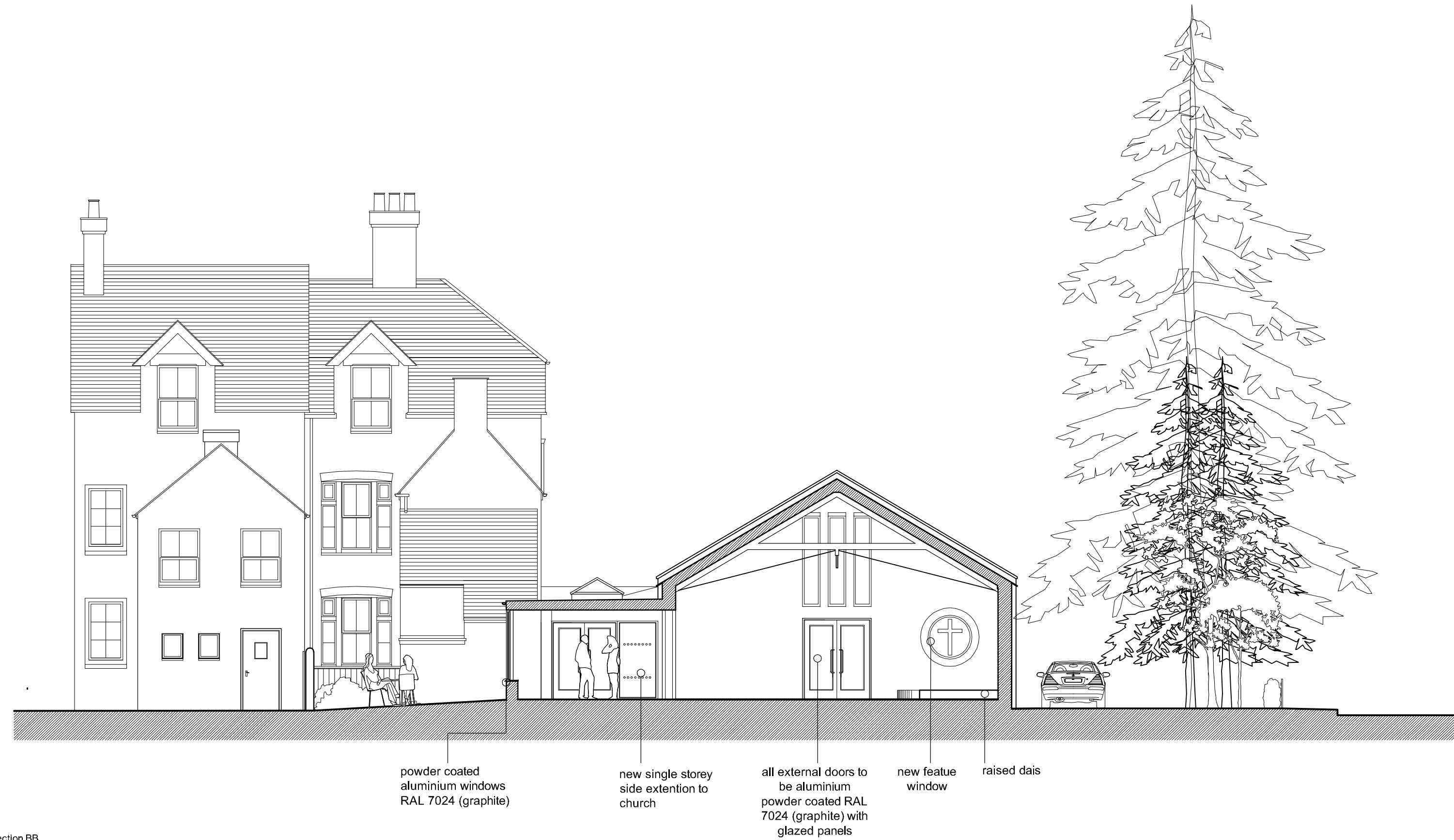
02 Section BB