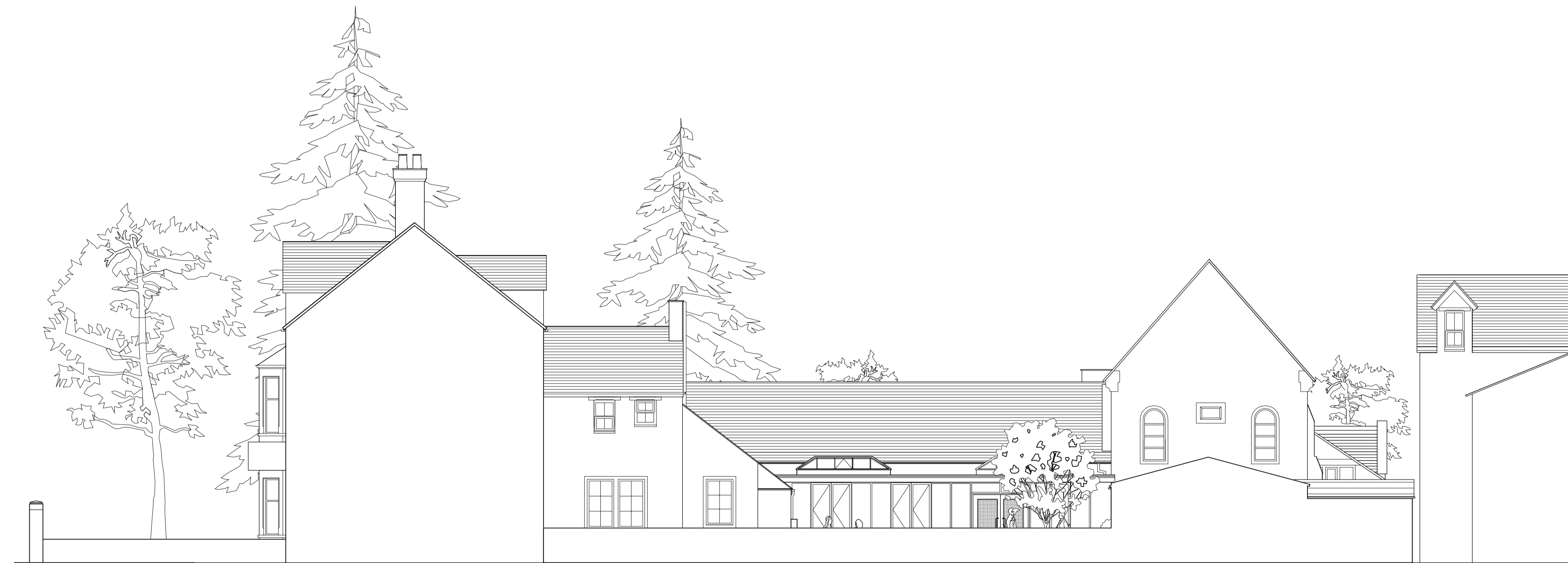
02 South Elevation (with trees)