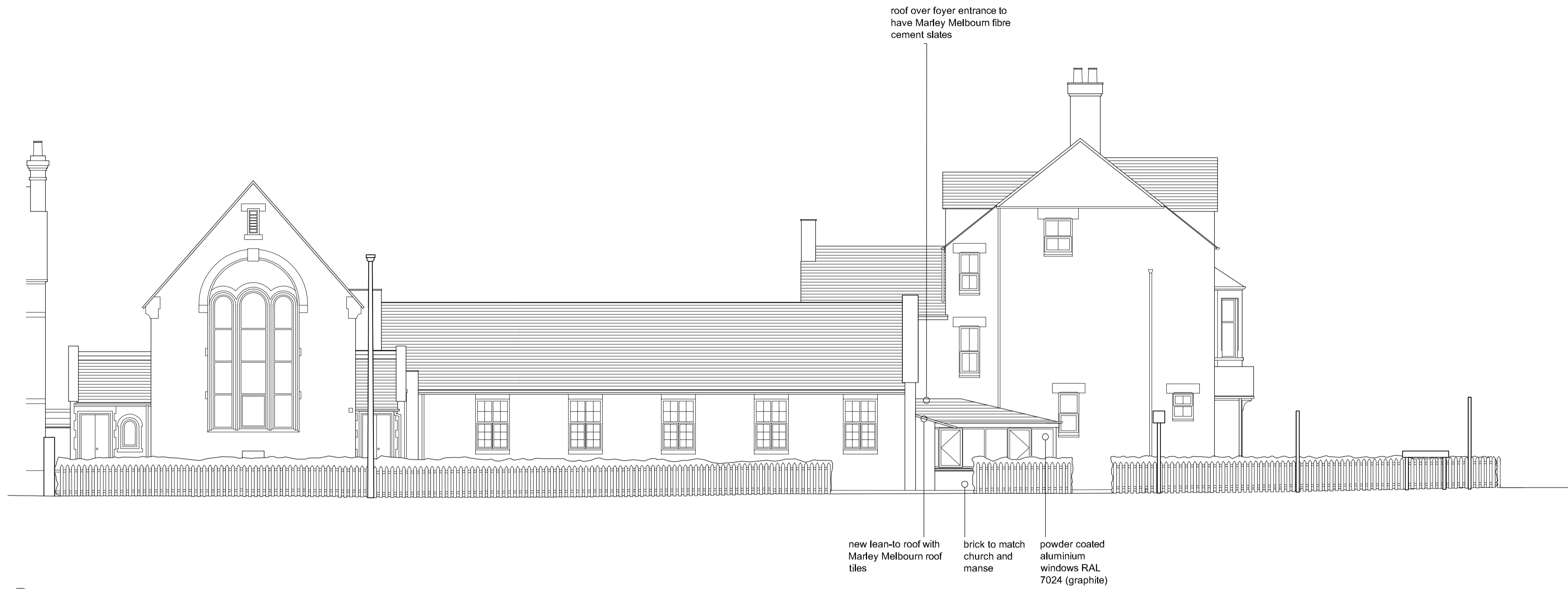
01 North Elevation (without trees) Beech Croft Road