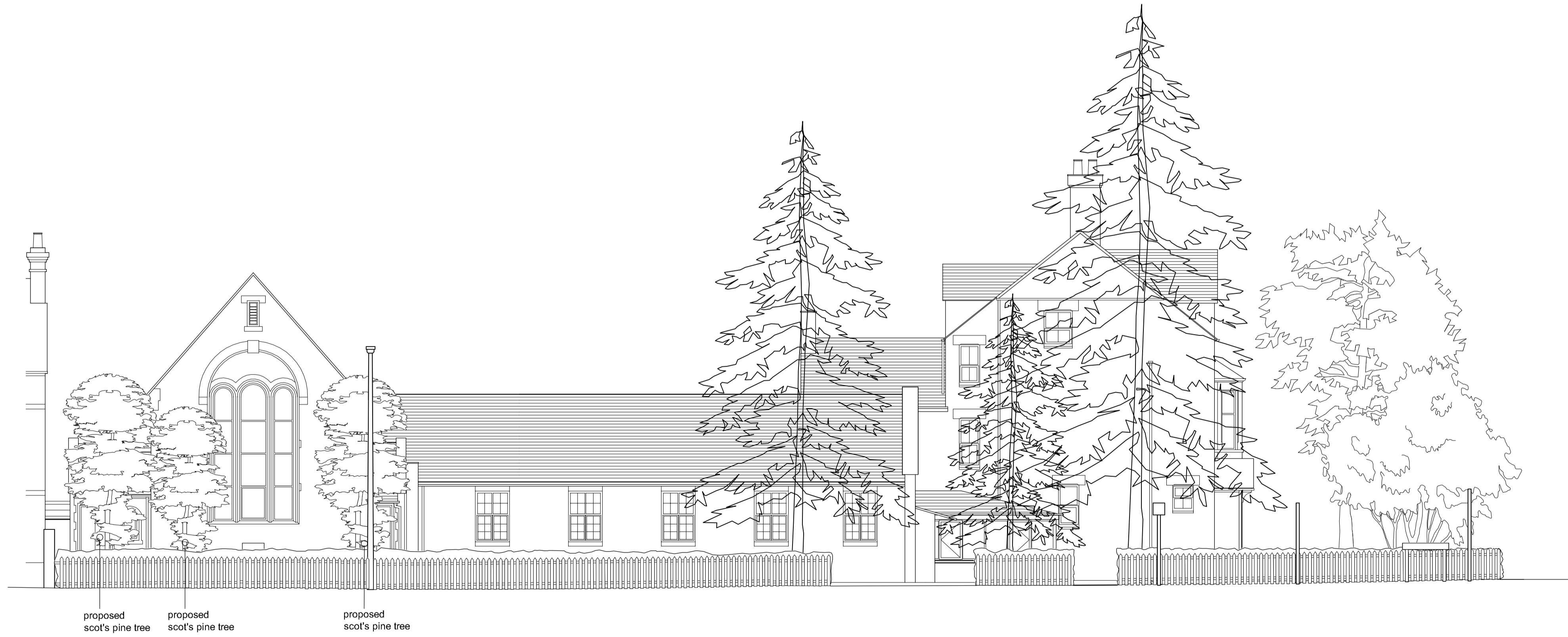
02 North Elevation (with trees) Beech Croft Road