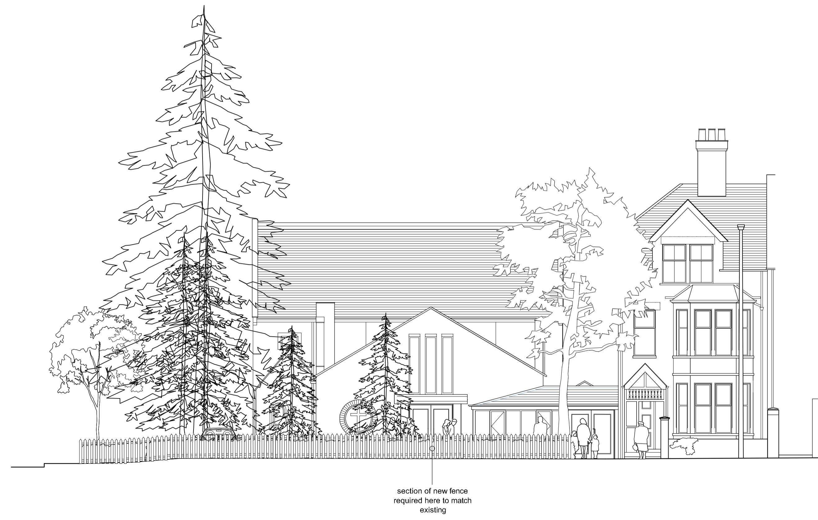
02 West Elevation (with trees) Woodstock Road